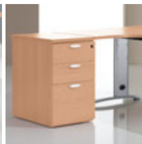
Structural desk height pedestal