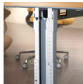
Height gauge etched into the surface of the metal