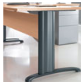
Melamine modesty panel to match the desktop