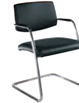
⑤ Armchair Leather