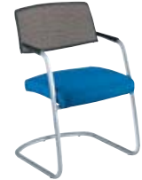
⑥ Black stretched fabric/fabric seat