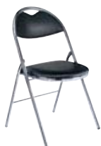
① Chrome frame