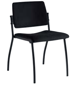
Chair with black casing and chrome, aluminium or black structure.

Please contact us for information regarding arms, writing shelves, link systems, spacing bars and trolleys.