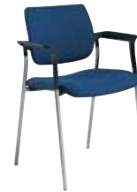
② 4 leg chair with arms