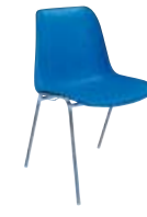
② Chair with link