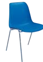
① Chair without link