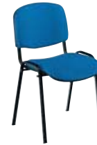
① Black/fabric ② Chrome/leatherette