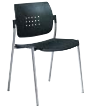
⑨ 4 leg chair from stock