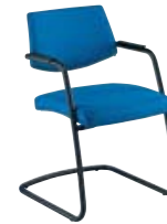
④ Set of 2 armchairs Fabric