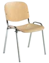
⑦ Black/wood ⑧ Chrome/wood