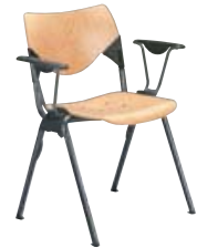
⑨ With arms