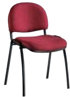
① Black frame