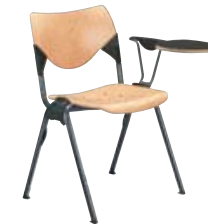
⑧ With folding writing shelf