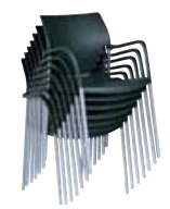
Stackable – 7 chairs maximum