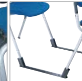
Spacing bar - to ensure perfect alignment of chairs