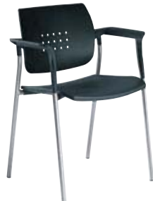
4 leg chair with arms