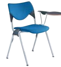
② With folding writing shelf