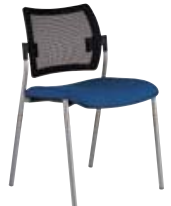
⑪ 4 leg chair from stock

4 leg mesh back chairs with arms and cantilever mesh back chairs with and without arms available on request