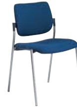
① 4 leg chair from stock