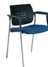
⑥ 4 leg chair with arms