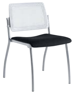
4 leg chair

• Castor-mounted chairs are available from stock with black fabric (FA) or simulated leather (YA) upholstery only.