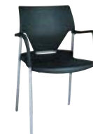
② Chair with arms