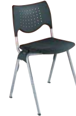
④ 4 leg chair