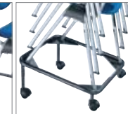
Trolley - to transport up to 10 chairs at a time