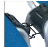
Short link system - to join 2 chairs without arms