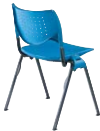
4 leg polypropylene chair