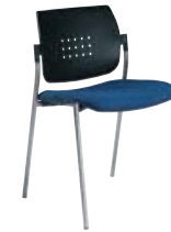
⑤ 4 leg chair from stock