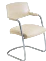
⑨ Ivory/ivory leather