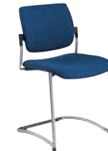
③ Cantilever chair