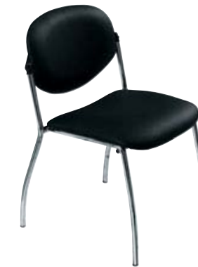
① 4 leg chair