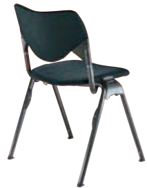
4 leg fabric chair