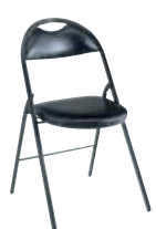
② Black frame