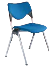
① 4 leg chair