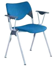
③ With arms