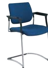
④ Cantilever chair with arms