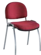
② Aluminium frame