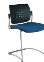
⑦ Cantilever chair