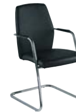
② Armchair Leather