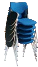
Stackable - 7 chairs maximum