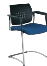
⑧ Cantilever chair with arms