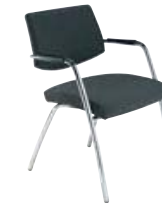
⑩ Armchairs Fabric