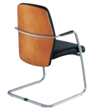
③ Leather with wood back and aluminium base