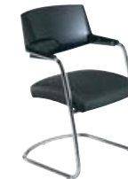
⑧ Black/black leather