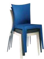
Stackable – 4 chairs maximum