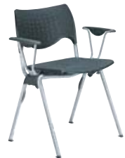
⑥ With arms