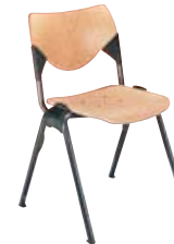
⑦ 4 leg chair