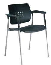
⑩ 4 leg chair with arms