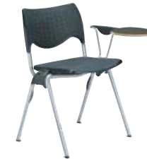
⑤ With folding writing shelf