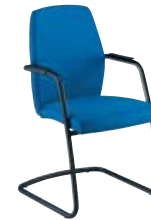
① Set of 2 armchairs Fabric