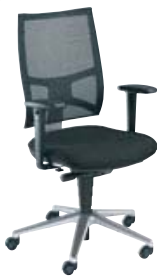
③ With adjustable multi-function arms