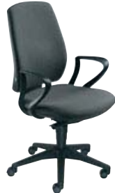
Ⓜ With fixed arms