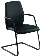
High back with ⑤ leather or ⑥ fabric upholstery – fabric model sold in sets of 2