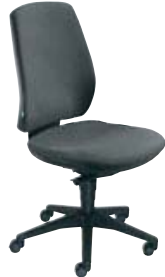
Ⓜ Without arms