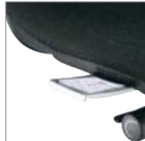
Operating instructions can be found under the seat

The Team Progress chair with metal base (SB, SQ or SW) complies with British Standard BS 5459 (24/24h office use, by individuals up to 150 kg in weight).