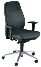
Fabric or leather upholstery with ① adjustable multi-function arms or ② fixed arms