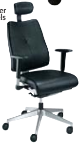
① With headrest and multi-function arms