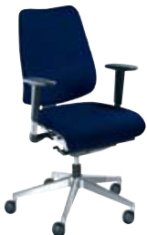
⑥ With multi-function arms