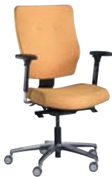
④ With adjustable multi-function arms