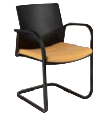
⑧ With arms and black polypropylene backrest