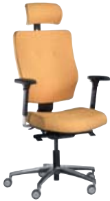
① With adjustable multi-function arms