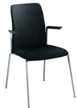
⑪ 4 leg fabric – stackable with fixed arms (on request) ⑫ 4 leg fabric – stackable without arms (on request)