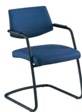
⑧ Medium back sold in sets of 2