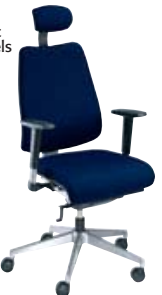
⑤ With headrest and multi-function arms