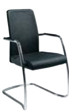
⑩ Cantilever fabric or leather - stackable