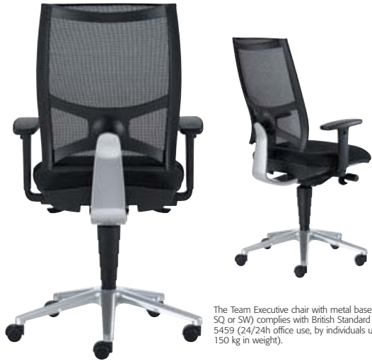
The Team Executive chair with metal base (SB, SQ or SW) complies with British Standard BS 5459 (24/24h office use, by individuals up to 150 kg in weight).