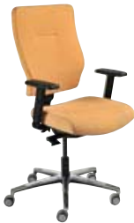
⑤ With adjustable arms