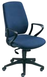
Ⓜ With fixed arms