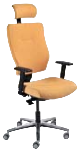
② With adjustable arms