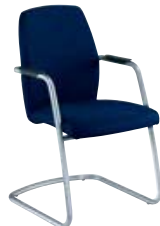
⑧ Set of 2 cantilever visitor chairs