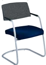
⑦ Medium back with stretched fabric upholstery