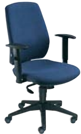
Ⓜ With height-adjustable arms