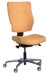
⑥ Without arms