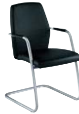
④ Cantilever visitor chair