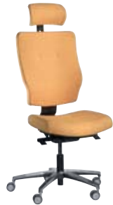
③ Without arms