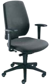
Ⓜ With adjustable arms