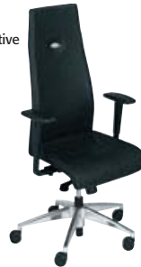
⑦ With adjustable designer arms ⑧ With adjustable multi-function arms