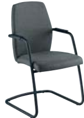
Ⓜ High back sold in sets of 2