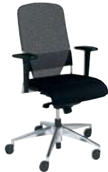
① With adjustable multi-function arms