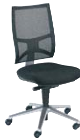
④ Without arms