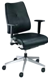
② With multi-function arms