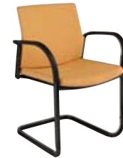
⑦ With arms and upholstered backrest