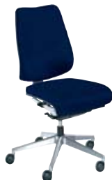
⑦ Without arms