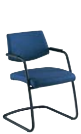
Ⓜ Medium back sold in sets of 2