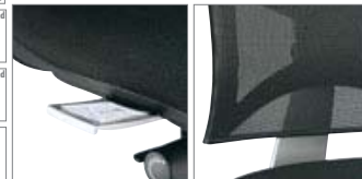
Operating instructions can be found under the seat. Backrest of Team Progress Air