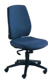
Ⓜ Without arms