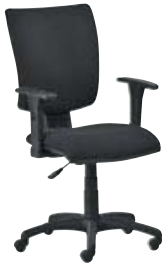
④ With adjustable arms