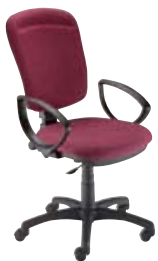
⑤ With fixed arms