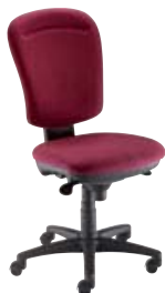
③ Without arms