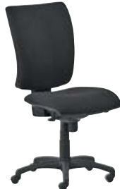
③ Without arms