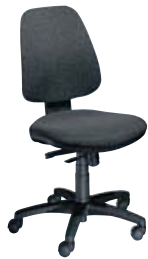
③ Without arms