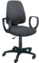
⑤ With fixed arms