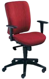
① With adjustable arms