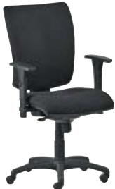
① With adjustable arms