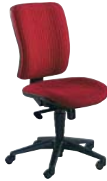
③ Without arms