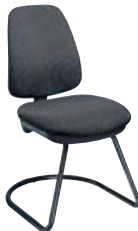
⑧ Without arms