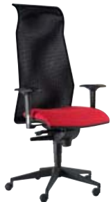
① With adjustable arms