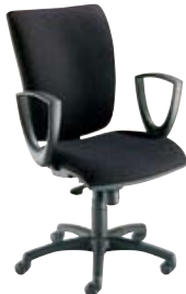
② With fixed arms