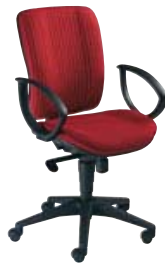
② With fixed arms