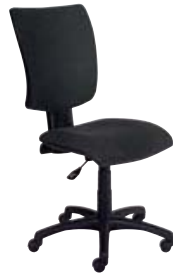
⑥ Without arms