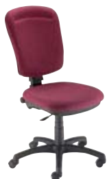
⑥ Without arms