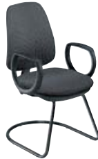
⑦ With fixed arms