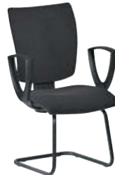
⑦ With fixed arms