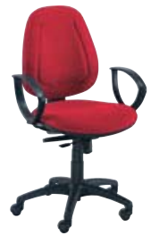
② With fixed arms