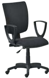
⑤ With fixed arms