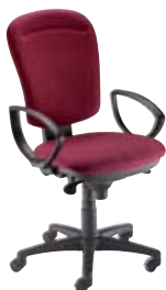
② With fixed arms