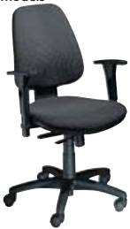
① With adjustable arms