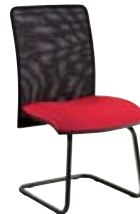
⑤ Without arms