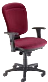
① With height-adjustable arms