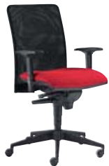
③ With adjustable arms