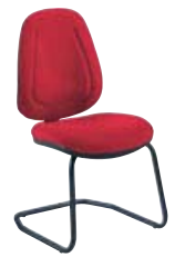
⑤ Without arms