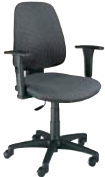
④ With adjustable arms