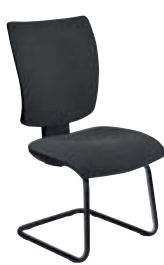
⑧ Without arms