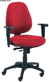
① With height-adjustable arms