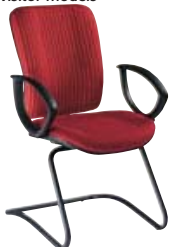
④ With fixed arms