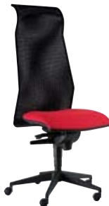
② Without arms