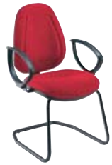
④ With fixed arms