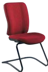
⑤ Without arms