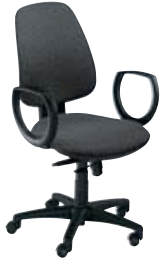
② With fixed arms