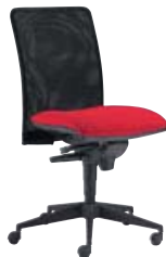
④ Without arms