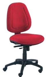
③ Without arms