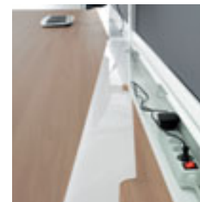
Large capacity cable trough