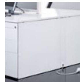
Cable storage kit with upper or lower port

The Bench System combines a range of flexible storage units with the potential to accessorize.