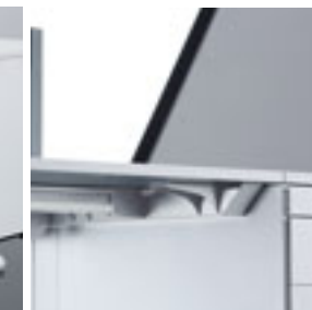
Link to connect pedestal/tops/beam