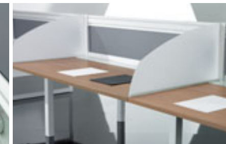
Side screens in white alutglass