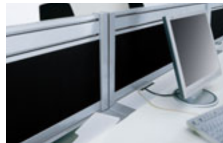
Easy access to cables and sockets via the removable cover

The bench system promotes and encourages teamwork, one of the key motivating factors in the modern office.