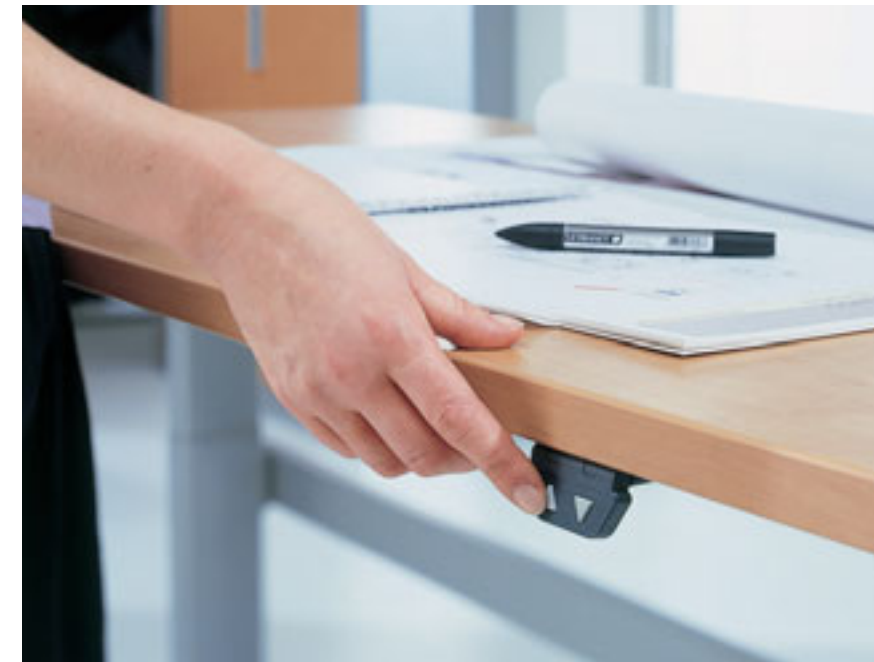
Discreetly positioned height adjustment controls

The sit-stand desk is designed to enhance the physiological well-being of users. The desk can be converted silently and effortlessly from the sitting position to the standing position in just 5 seconds.