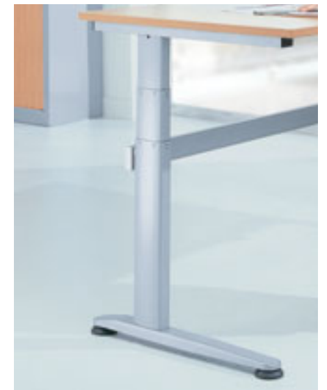
Adjustable in height from 62 to 130 cm