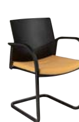
⑧ With arms and black polypropylene backrest