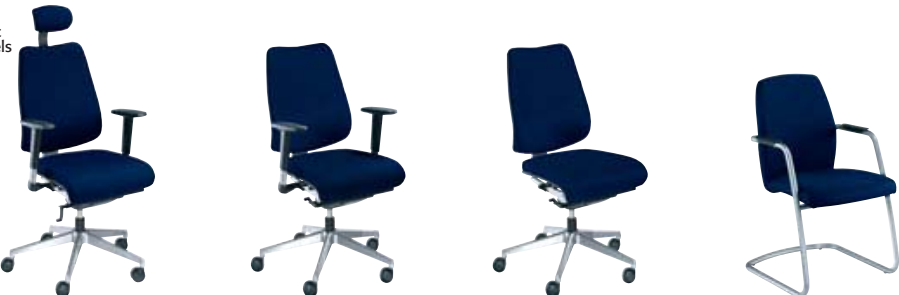
⑤ With headrest and multi-function arms ⑥ With multi-function arms ⑦ Without arms ⑧ Set of 2 cantilever visitor chairs