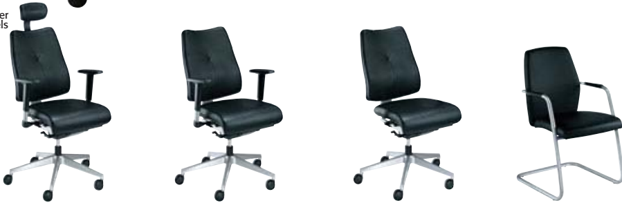
① With headrest and multi-function arms ② With multi-function arms ③ Without arms ④ Cantilever visitor chair